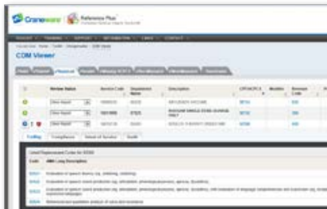
Everything you need, clearly displayed in a single screen

Reference Plus is created exclusively to support your hospital’s specific business needs. It includes all the necessary tools to perform a complete chargemaster analysis – while simultaneously giving you a single source of continually up-to-date clinical, financial and regulatory coding data. So you can manage your compliance risk – with confidence.